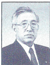
Dr. Shoichiro Toyoda

The 2004 Deming Medal has been awarded Dr. Shoichiro Toyoda, Honorary Chairman of Toyota Motor Corporation. The medal, which is awarded annually by the American Society for Quality (ASQ), was presented to Dr. Toyoda at ASQ's annual congress in Seattle.